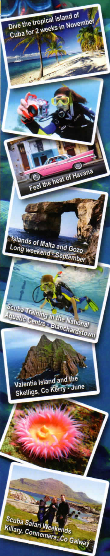
Dive the tropical island of Cuba for 2 weeks in November